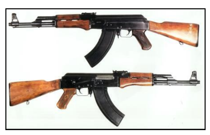
Avtomat Kalashnikova 1947g, First Type

constructed and submitted for firing tests. The tests indicated that some additional work was required. The 1946 Avtomat differs somewhat from the eventual AK47. The receiver body had a different profile, the gas piston housing was closer to the barrel, the receiver cover was shaped differently. The butt was attached by two metal extensions that slid over the rear of the receiver, and the fire control lever was mounted on the left side of the receiver.