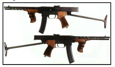
Kalashnikov Test Model Submachinegun of 1942

process was the Pistolet Pulemet Degtyareva, or PPD34. The PPD34, and its successor, the PPD34/38 worked well enough, but required too much in the way of precision manufacturing to be suited for mass production on the scale that the Red Army would require during World War II. As a result, a much simpler design was submitted by G.S. Shpagin, and adopted in 1941 as the PPSh41. One of the PPSh41's most significant innovations was the use of stamped and pressed sheet metal assemblies produced from mild steel. While the PPSh41 was good, there was room for improvement, and a series of trials was held in 1942, and Kalashnikov submitted a design for consideration. Despite Kalashnikov's labors, A.I. Sudayev won the competition with his PPS43.