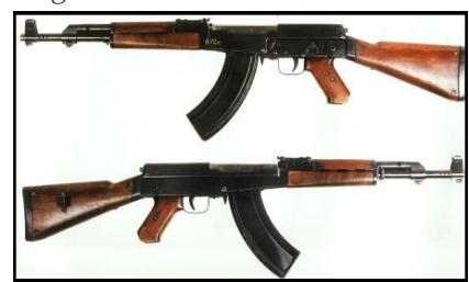
Kalashnikov Experimental Avtomat of 1946